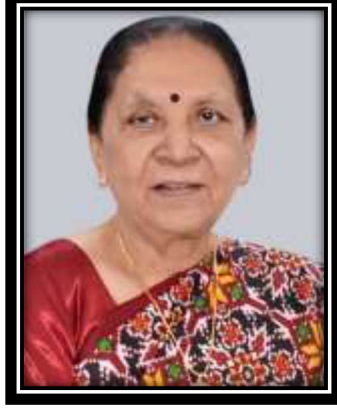
माननीय श्री राज्यपाल एवम् कुलाधिपति