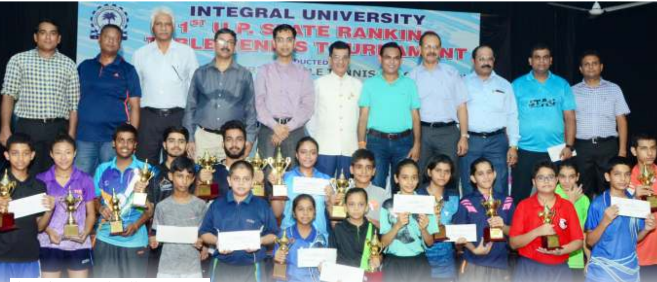
Glimpses of 1st U.P State Ranking Table Tennis Tournament