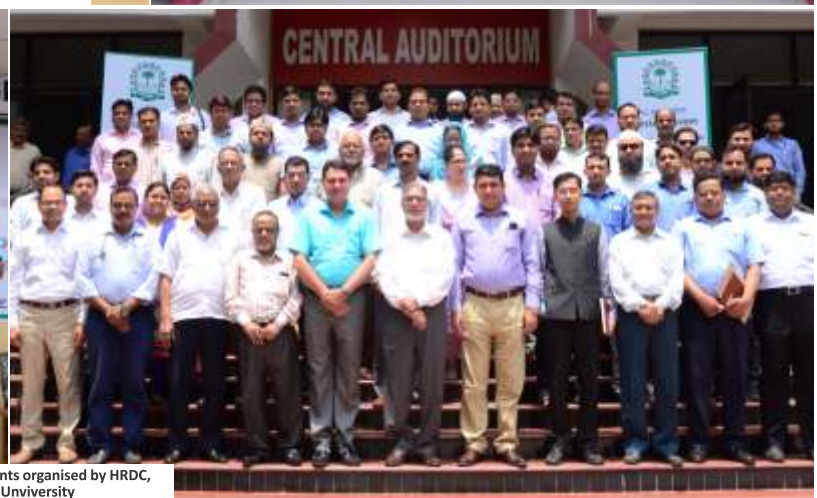
Glimpses of the events organised by HRDC, Integral University