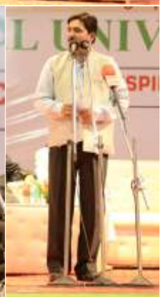
Some Glimpses of All India Mushaira at Integral University on the occasion of FIESTA 2018