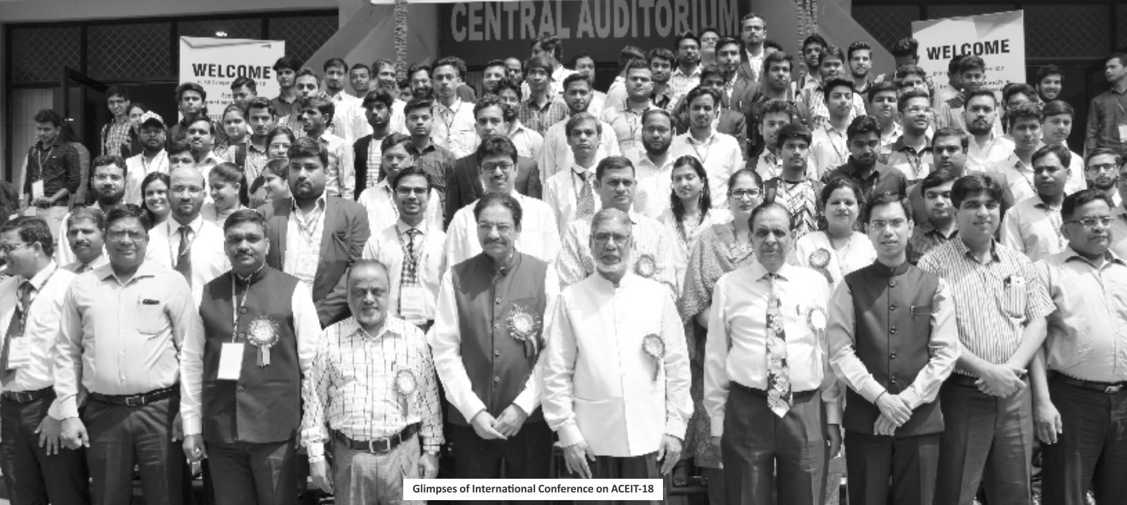
Glimpses of International Conference on ACEIT-18