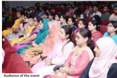
Audience of the event