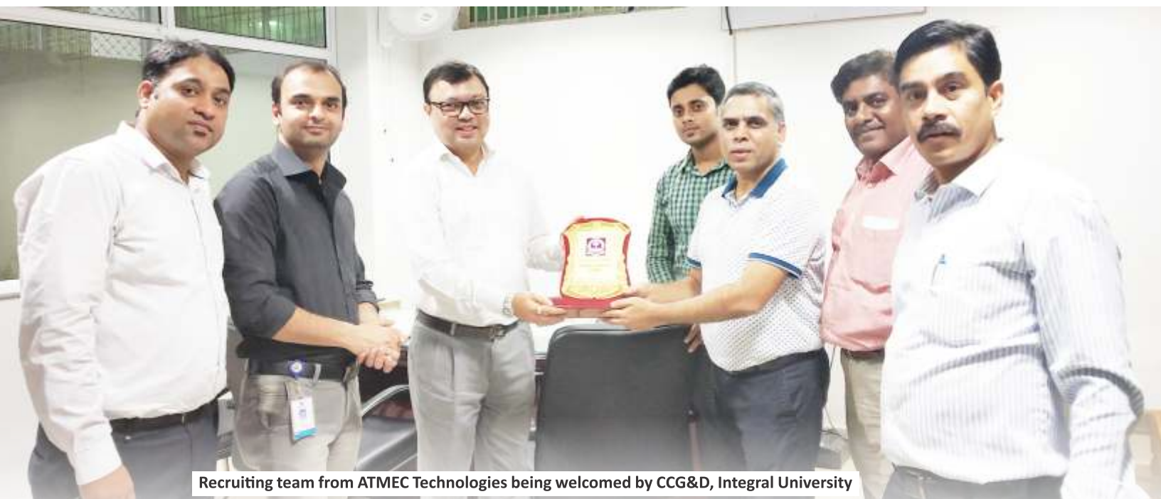
Recruiting team from ATMEC Technologies being welcomed by CCG&D, Integral University